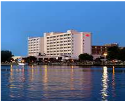
Hilton Riverside, Wilmington, NC – site of 2009 Convention