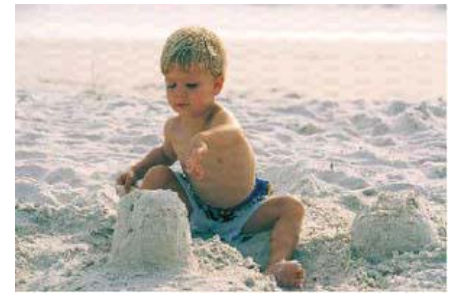
SHELL ISLAND RESORT, Wrightsville Beach

This 90 minute fun-filled walking tour will have you laughing and crying, and you better do it on cue if you ever want to work in this town again