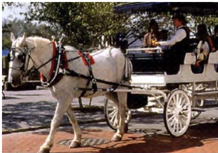
HORSEDRAWN CARRIAGE & TROLLEY TOURS

Standing with quiet dignity and majesty across the river from downtown Wilmington, the Battleship NORTH CAROLINA beckons visitors to walk her decks and envision daily life as well as fierce combat that her crew faced in the Pacific Theatre during World War II.