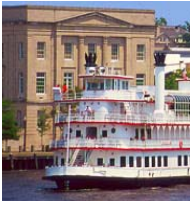
Henrietta III – Sightseeing Cruises